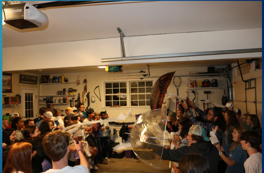
Club toilet paper fight